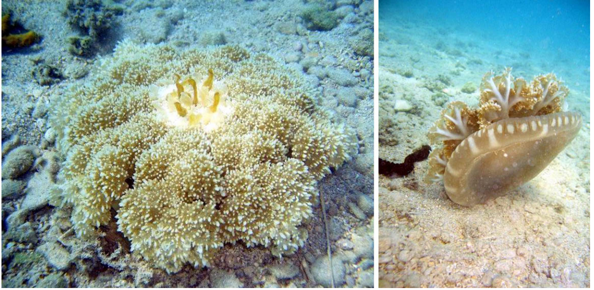
Figure 3. Cassiopea andromeda in the Ölüdeniz Lagoon, lying mouth upward on the bottom.

marshy coast with extended silty, muddy bottoms and waters shallower than 4m. Station 6 is a touristic sandy beach.